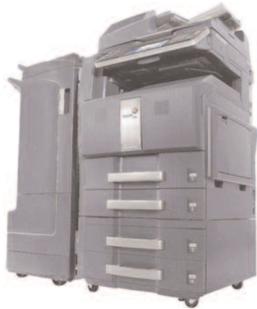
Machine pictured may not be configured as described.

The Kyocera TASKalfa 300ci redefines Color Multifunctional Systems with a bold and innovative new design that delivers the unsurpassed performance, superior image quality and ultra-reliability that your business demands. Engineered with superior performance in mind, the TASKalfa 300ci will revolutionize the office environment. At productive output speeds of 30 ppm in both color and black and the unique long life technology built into the TASKalfa 300ci, you are assured superior document handling, ultimately maximizing your business efficiency.