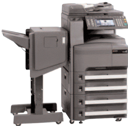
Machine pictured may not be configured as described.

At a productive output speed of 30 pages per minute, the TASKalfa 300i delivers crisp black & white output, brilliant scans in both full color and black & white, and optional fax/network fax. Engineered with Kyocera's unique long-life technology and embedded HyPAS, Kyocera's powerful and scalable software solutions platform, the TASKalfa 300i provides you with maximum performance.