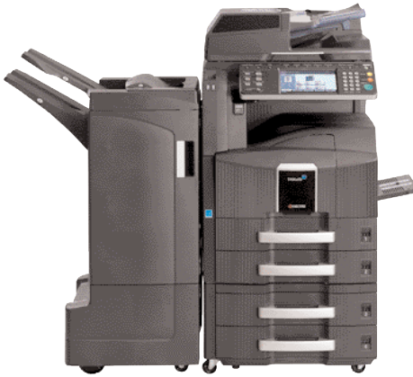
Machine pictured may not be configured as described.

A powerful combination of a fast and efficient 52 ppm output speed, Kyocera's unique long life technology and innovative features, such as full color scanning and USB host interface, make the TASKalfa 520i essential to all your document imaging tasks. The TASKalfa 520i's performance can be further optimized with HyPAS, Kyocera's unique, powerful and scalable software solutions platform. HyPAS delivers a broad range of options that enable the TASKalfa 520i to seamlessly integrate with widely accepted software applications and operate in virtually any copier environment.