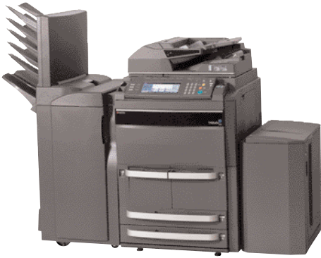
Machine pictured may not be configured as described.

The Kyocera TASKalfa 620 B&W Multifunctional System provides a robust imaging solution for any business. Designed to meet the demands of any workgroup or department, the TASKalfa 620 incorporates ultra-reliability, high-performance and exceptional productivity to become an essential part of today's fast-paced business. At 62 ppm, and with a flexible choice of paper handling and finishing options, the TASKalfa 620 will become an essential part of your business.