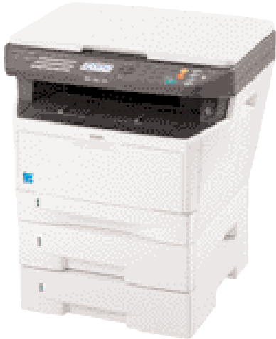
Machine pictured may not be configured as described.

Description: The FS-C1020MFP offers flexibility, output quality, and performance in a compact desktop footprint. With standard features like network connectivity for printing and scanning, copying, efficient faxing, paper-saving duplex support, quick warm up times and a easy to use control panel the FS-C1020MFP offers tremendous value to your customers.