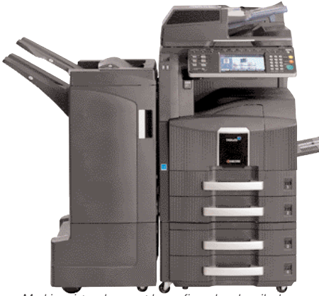
Machine pictured may not be configured as described.

At an impressive 42 ppm the TASKalfa 420i combines unique long life technology and a robust array of features, such as full color scanning and USB print-from and scan-to functionality. Designed to meet your specific document imaging requirements, the HyPAS-enabled TASKalfa 420i seamlessly integrates with widely accepted software applications and operates in virtually any environment. Engineered with innovative product features and proven reliability, the Kyocera TASKalfa 420i will revolutionize your copier environment